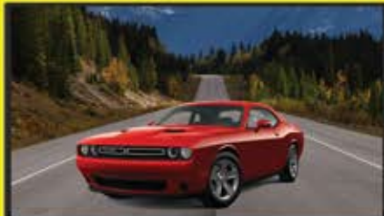
The 2023 Dodge Challenger