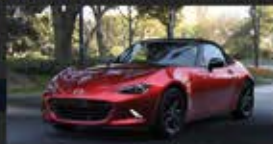
The 2023 Mazda Miata