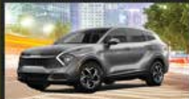
The 2023 Kia Sportage

You choose the winning car! Dodge v Chevy - or pick a Kia Sportage, Mazda Miata, or Mitsubishi Outlander.