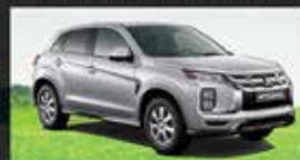
The 2023 Mitsubishi Outlander

1 ticket for $25 or 5 tickets for $100 Donation.