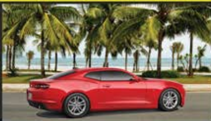
The 2023 Chevrolet Camaro