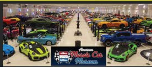
6p-9p - Saturday - Oct 7th 2023 - Grand Drawing Celebration

2023 Dodge v Chevy Challenge. The Final Showdown