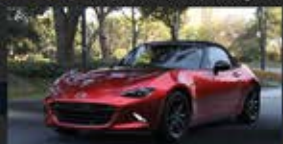
The 2023 Mazda Miata