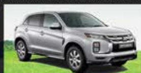
The 2023 Mitsubishi Outlander

1 ticket for $25 or 5 tickets for $100 Donation. HelpingSeniorsCarRaffle.com Tickets Online or by calling 321-473-7770 Get tickets at all Boniface-Hiers Automotive Group Dealerships.