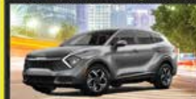
The 2023 Kia Sportage

You choose the winning car! Dodge v Chevy - or pick a Kia Sportage, Mazda Miata, or Mitsubishi Outlander.