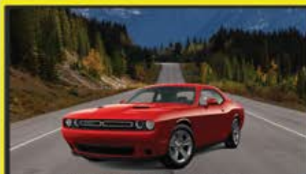
The 2023 Dodge Challenger