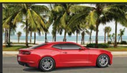
The 2023 Chevrolet Camaro