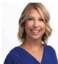
Legal Planning & Assisted Living Preparation