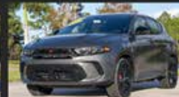
For the Sporty You ... 2026 Dodge Hornet