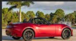
For the Roadster You ... 2026 Mazda Miata

1 ticket $25 or 5 tickets for $100 donation