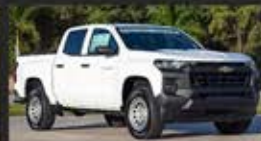
For the Hauler You ... 2026 Chevrolet Colorado