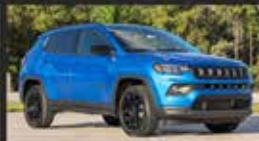
For the Explorer You ... 2026 Jeep Compass Sport